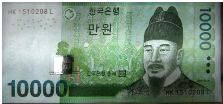
10,000 won (approx. $8.9)