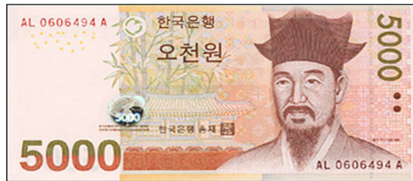
5,000 won (approx. $4.46)