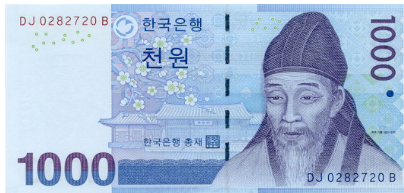
1,000 won (approx $.89)