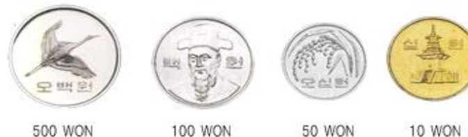
(approx. 45, .09, .045, .009 cents, respectively)

*Won rate based on Oct 2008 rate of 1120 won/dollar